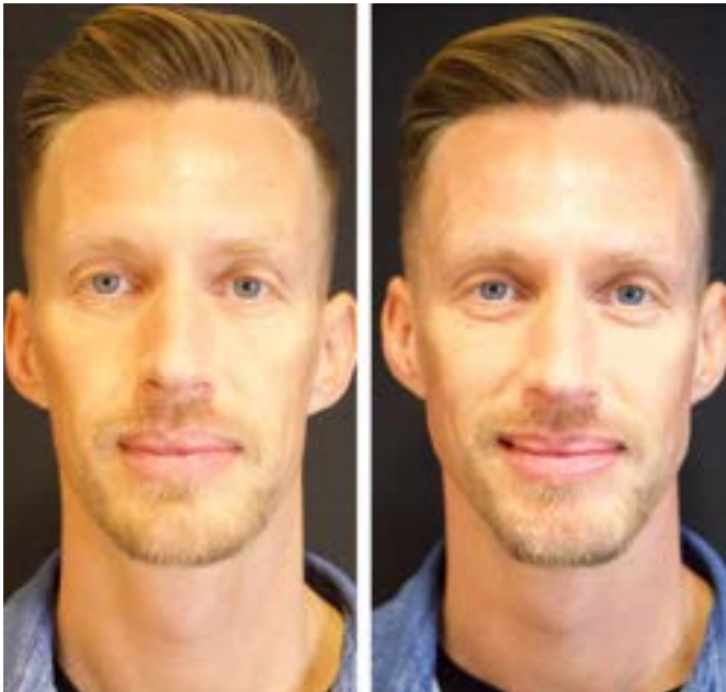
Above left: Full facial harmonisation